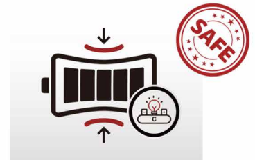
The test of squeeze