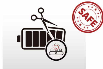
The test of shear