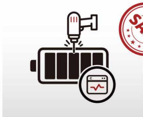
The test of drill